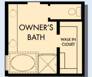
OPTIONAL DROP IN TUB WITH SEPARATE SHOWER AT OWNER'S BATH