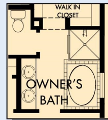
OPTIONAL DROP IN TUB WITH SEPARATE SHOWER AT OWNER'S BATH