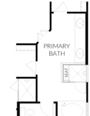
OPT. PRIMARY BATH