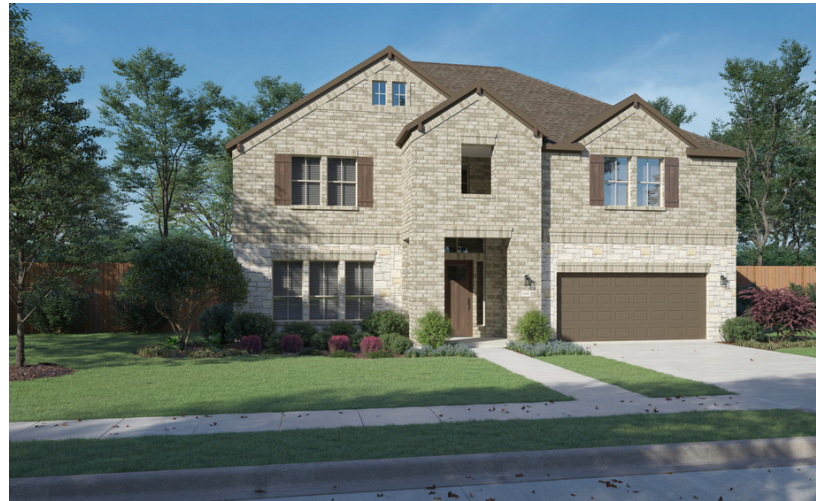
ELEVATION B STONE OPTION