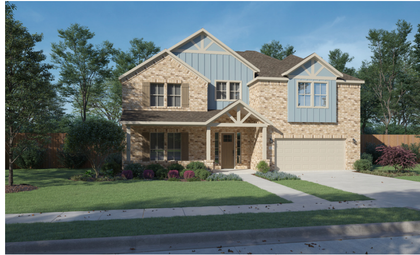
ELEVATION A STONE OPTION