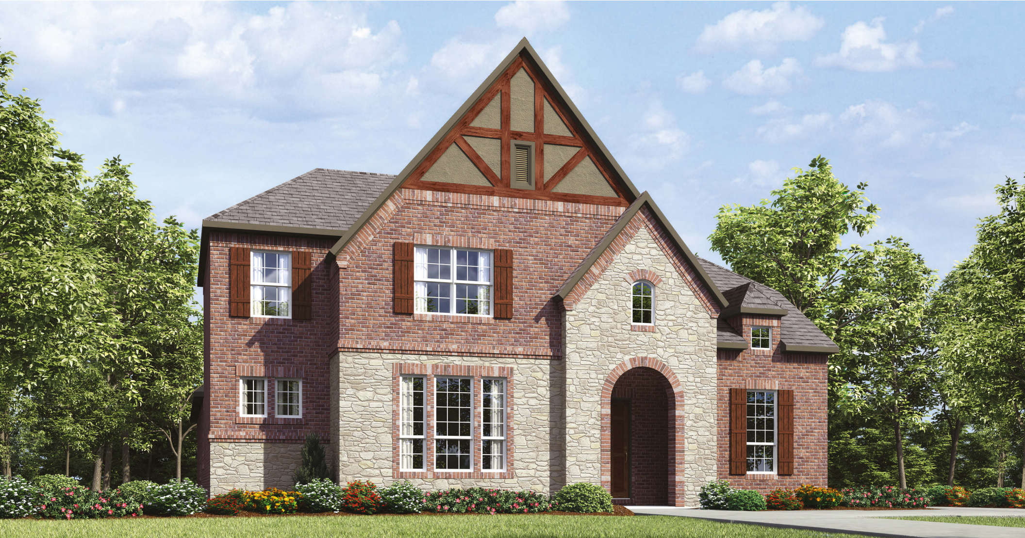
Seneca II A

The elevations and floor plans in this brochure show optional items.