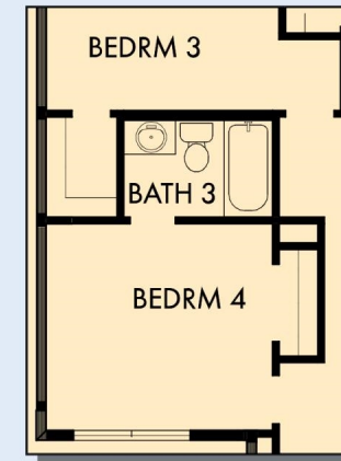
OPTIONAL BEDROOM 4 WITH BATH 3 AT RETREAT